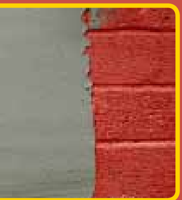
Perfect rendering when applied over 507 Rendagrip