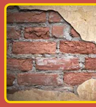
Cracked broken rendering when applied onto bare brick