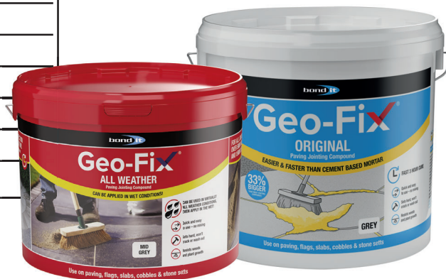
Part of the Geo-Fix Range

The data presented in this leaflet are in accordance with the present state of our knowledge, but do not absolve the user from carefully checking all supplies immediately on receipt. We reserve the right to alter product constants within the scope of technical progress or new developments. The recommendations made in this leaflet should be checked by preliminary trials because of conditions during processing over which we have no control, especially where other companies raw materials are also being used. The recommendations do not absolve the user from the obligation of investigating the possibility of infringement of third parties rights and, if necessary clarifying the position. Recommendations for use do not constitute a warranty, either expressed or implied, of the fitness or suitability of the products for a particular purpose.