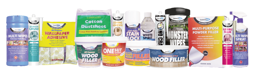
Part of the Bond It Decorating Sundries Range

The data presented in this leaflet are in accordance with the present state of our knowledge, but do not absolve the user from carefully checking all supplies immediately on receipt. We reserve the right to alter product constants within the scope of technical progress or new developments. The recommendations made in this leaflet should be checked by preliminary trials because of conditions during processing over which we have no control, especially where other companies raw materials are also being used. The recommendations do not absolve the user from the obligation of investigating the possibility of infringement of third parties rights and, if necessary clarifying the position. Recommendations for use do